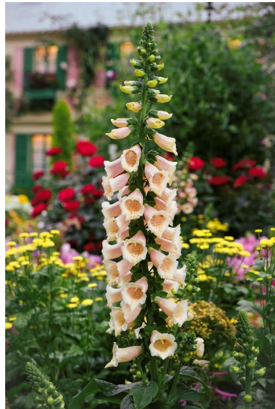
Digitalis purpurea cultivar (Foxglove)

Monet, who gathered seeds of common purple foxgloves from cliff walks near Dieppe in France, appreciated the tall, slender spikes of purple flowers that added colour and texture to his garden at eye level.