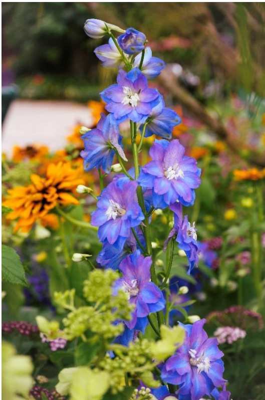
Delphinium cultivar (Larkspur)

Monet positioned larkspurs in slender beds beside the pink walls of his house and beneath the shade of trees, where he found their blue shades particularly captivating.