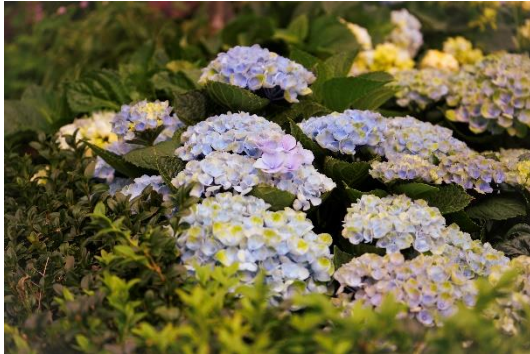
Hydrangea macrophylla cultivar (Hydrangea)

Hydrangeas are known for their large, globular flower heads, which can vary in colour from blue to pink to red depending on the soil's pH level. Acidic soil conditions produce blue flowers, while neutral to alkaline soils result in pink or red blooms. Monet would often amend the soil with peat moss and manure to enhance the blue colouring. Its dense shrubs provide a conducive habitat for ladybugs and spiders that helps keep pest populations in check.