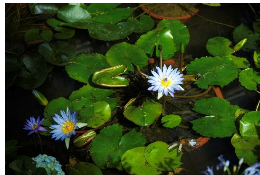
Nymphaea (Water lily)

Matricaria have finely divided, feathery leaves and emit a sweet, mildly fruity scent. Their delicate, translucent petals capture and scatter the light, producing a sparkling effect when backlit, which Monet was drawn to.