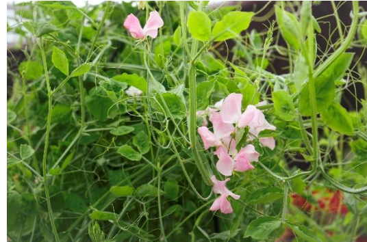
Lathyrus odoratus cultivar (Sweet Pea)

Sweet peas, with their characteristic legume structure and butterfly-shaped petals, are particularly cherished for their delightful fragrance and frilly petals, which come in a variety of colours. Monet planted sweet peas in pots before transferring them into his gardens onto tall bamboo tripods in spring. He also grew them off-season in his greenhouse for continuous indoor fragrance.