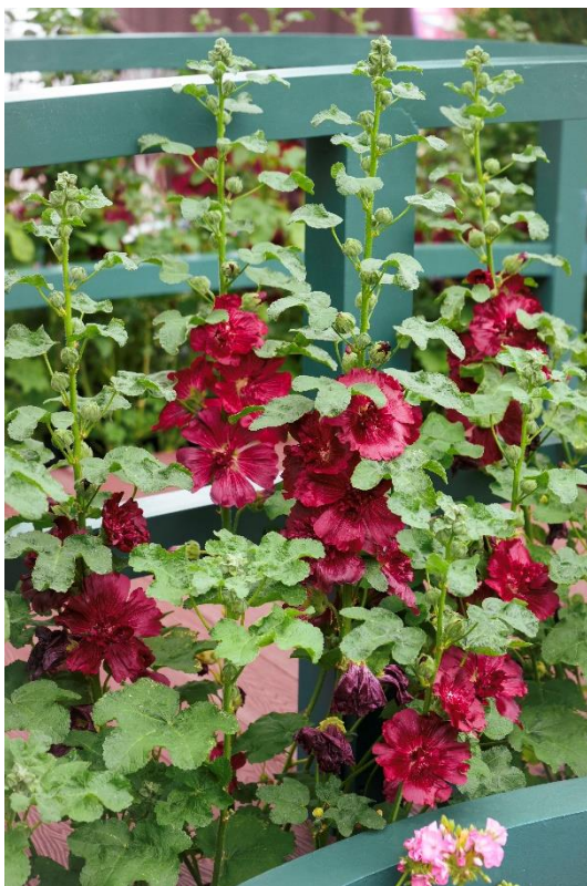
Alcea cultivar (Hollyhock)

Hollyhocks have strong stems that hold up their cup-shaped flowers, which bloom from the bottom up to create a tall column of colour. This